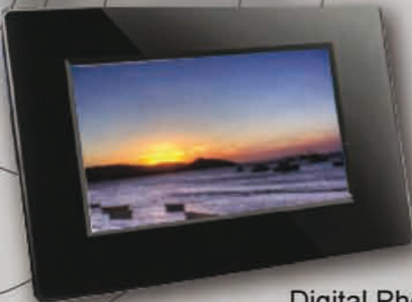
Digital Photo Frames