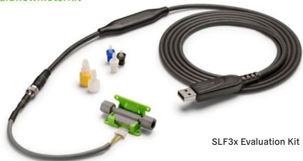
SLF3x Evaluation Kit

For more information please visit: www.sensirion.com/liquidflowmeterkit